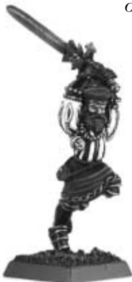
Ostlander Elder (below, left), Blood Brother (below, centre) and Priest of Taal (below, right).

Strictures: Priests of Taal may never wear heavy armour.